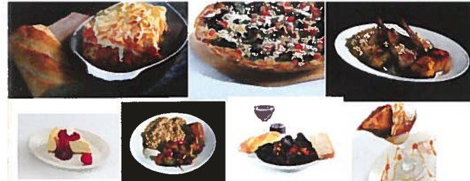
Homemade Farm to Table Mediterranean Delights