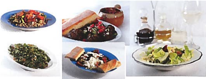
Fresh Ingredients and Large Portions