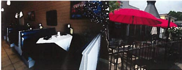
Beautifully Decorated Restaurant and Patio