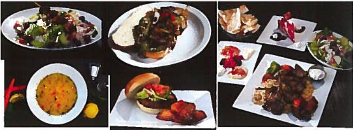
Fresh Ingredients and Large Portions