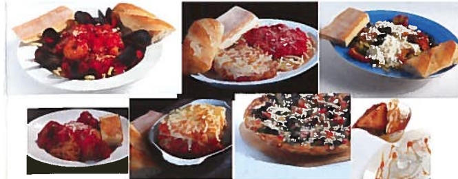
Homemade Farm to Table Mediterranean Delights