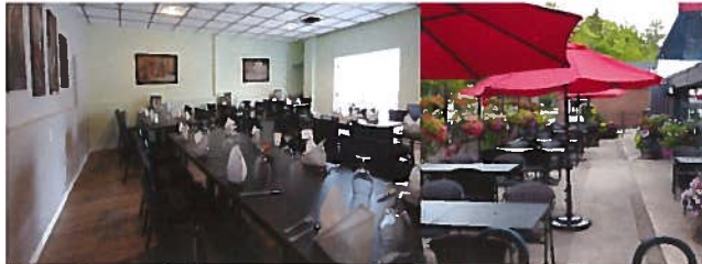
Beautifully Decorated Restaurant and Patio